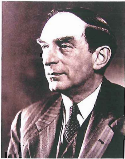
The Honorable Reuben Oppenheimer